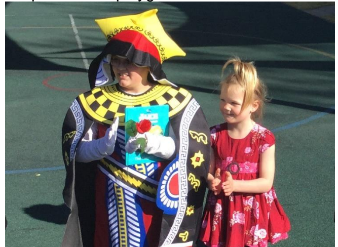
A royal visitor.