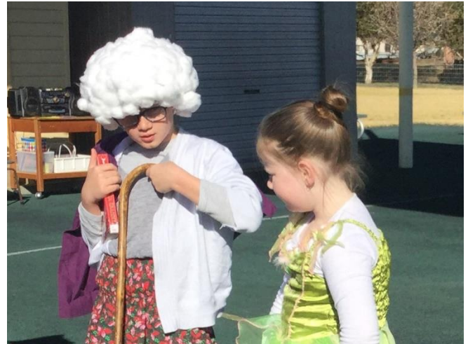
Who is this little old lady?