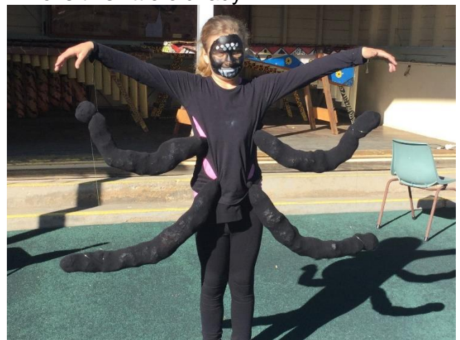
A Spider in the playground!