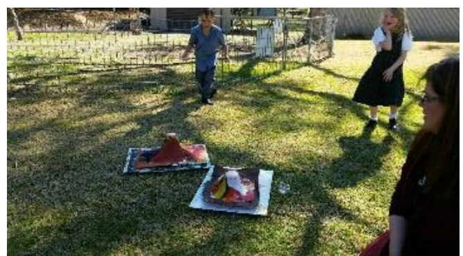
Our Volcanoes erupting.