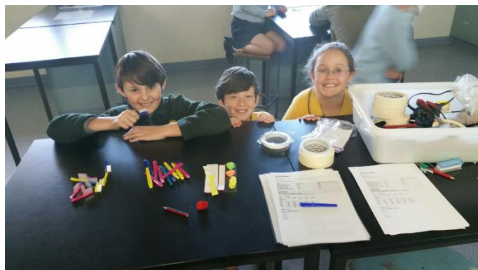
Building Bristle Bots.