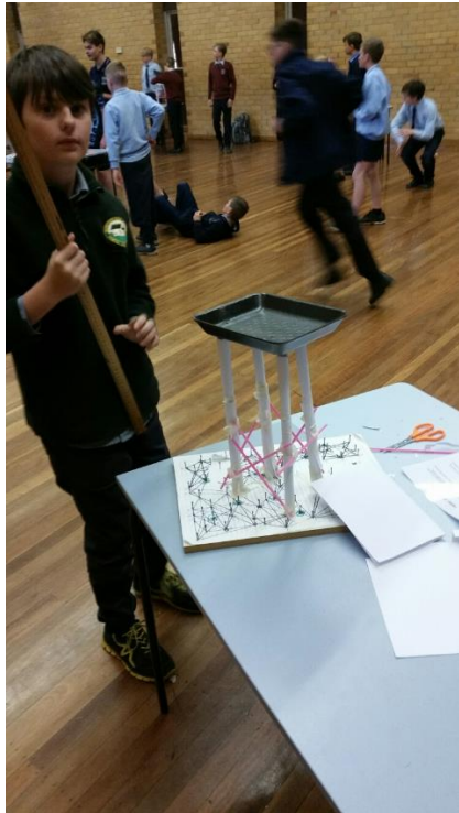
How strong is our tower????

19 th at 11:00am. If you know of any carers who may wish to attend, please let them know the event is on. It would also be helpful if you could let me know who is attending so we can cater for the event. Please see attached poster.