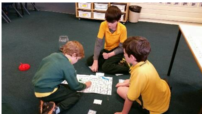
Safety Board Game

There will be no newsletter next Thursday.